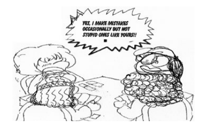
Playing with the stars. Bridge Column for April 29, 2001, By HARVEY BERNSTEIN Nort

If you walk up the stairs while you are distracted, you could miss a step ending up down on the landing, instead of the upper level you were aiming for. If you play bridge, without paying attention to proper etiquette, you could miss an important part, the lifelong friendships you can cultivate, ending up on the landing, alone with your attitude. Tamera Norris